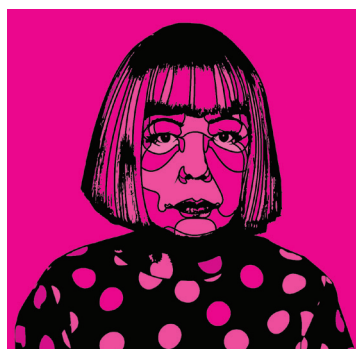
Left to right: PINK KUSAMA , acrylic on cement board, 8 x 8 ft. and AI WEI WEI , acrylic on cement board, 8 x 8 ft. on Yanonali Street.