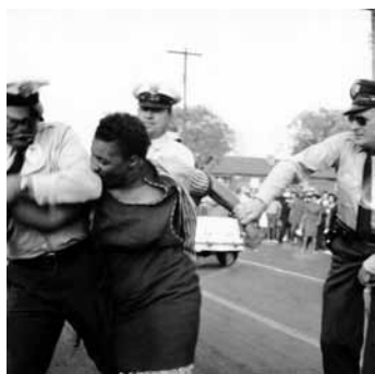
Unknown photographer, "Woman Resisting Arrest, Birmingham, Alabama, April 14, 1963," photograph, is currently on view at UC Santa Barbara.

Of all the Associated Press photographs taken during the Civil Rights struggle, those most likely to be widely published at the time tended to galvanize the sympathy of liberal white Northerners and reinforce the victimization of complacent, peaceful