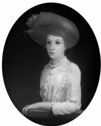
Travis Louie, “The Helmet Girl (Ode to Helmet Girls),” 2013, acrylic on board, oval frame, convex glass, 20 x 16”, is currently on view at Merry Karnowsky.

Rooted in landscape painting of the French Barbizon school, California artists of the pictorial approach to painting known as Tonalism, active from the 1870’s thru 1930’s, emphasized muted color harmonies, low value contrasts,