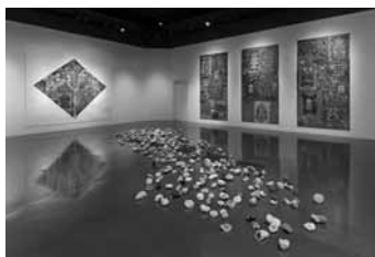
Alexandra Grant, “Century of the Self,” 2013, gallery installation, is currently on view at USC.

Doubling their impact, the artists exhibiting in “Drawn to Language” address issues of consequence to contemporary society, merging visual imagery with text in a variety of compelling ways. A circle of ten interlocking typing desks support each other, emphasizing community and collaboration in Susan Silton’s installation, “In everything there is a trace.” Each three-legged desk is topped with a vintage manual typewriter and a copy of John Steinbeck’s book, “Grapes of Wrath.” Volunteers re-typed sections of Steinbeck’s classic in barely visible stencil mode during a performance organized by Silton. In addition, framed pages from Phillips du Pury art auction catalogs, overlaid with stencil typed