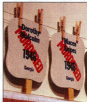
Handmade letterpress print on a fan by Amos Kennedy

A focus of Kennedy's work is to hold up the memory of the non-violent freedom fighters who were murdered during the civil rights movement. The exhibition includes 136 fans printed with the names of individuals who were murdered during the civil rights