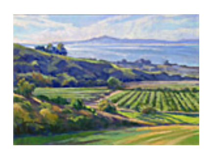
160127 CHAPMAN, CHRIS. Vedder Ranch, 10 x 13 inches | Pastel on paper Signed