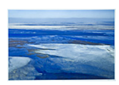
160132 DEWEY, BILL. Delta Blues, 12.5 x 19 inches | Photograph Signed