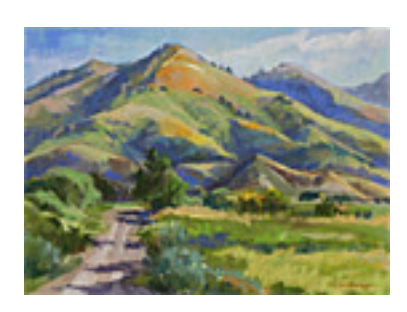
160128 CHAPMAN, CHRIS. Grass Mountain Spring, 9 x 12 inches | Pastel on paper Signed