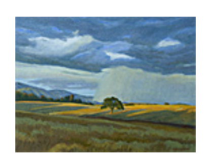
160141 IWERKS, JOHN. Spring Shower, Santa Ynez, 14 x 10 inches | Oil on canvas Signed