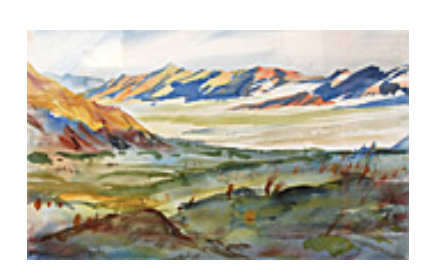
160142 IWERKS, LARRY. Desert Center, 20 x 30 inches | Watercolor on Signed