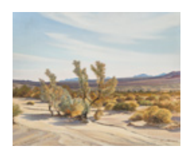
160149 STRONG, RAY. Palm Desert, 1946 16 x 20 inches | Oil on canvas Signed