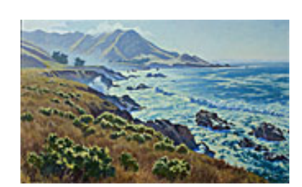
160130 COMER, JOHN. Native Land, 30 x 40 inches | Oil on canvas Signed