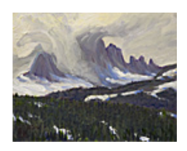
160145 MITCHELL, WILLIAM. Flurries on the Minarets, 8 x 10 inches | Oil on panel Signed