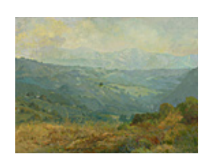
160123 ABBOTT, MEREDITH BROOKS. Morning Clearing, 2015 30 x 40 inches | Oil on canvas Signed