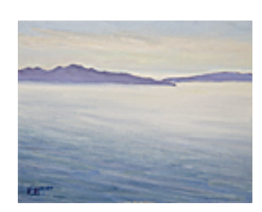
160144 MITCHELL, WILLIAM. Changing Channels, Ray Day, 8 x 10 inches | Oil on panel Signed