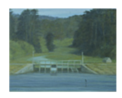
160153 VEDDER, SARAH. Dam at Pudding Creek, 11 x 14 inches | Oil on panel Signed