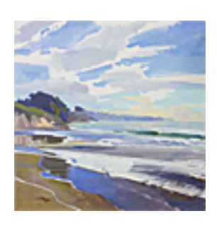
160126 BURTT, MARSHA. Spring Sky, 30 x 30 inches | Acrylic on canvas Signed