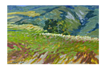
160143 LOPEZ, MANNY. Morning Foothills, 12 x 10 inches | Oil on canvas Signed