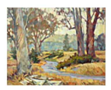
160124 ABBOTT, WHITNEY BROOKS. Road to the Canyon, 2015 16 x 20 inches | Oil on canvas Signed