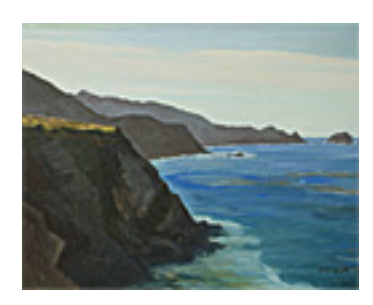
160148 SMITH, SKIP. Big Sur, 16 x 20 inches | Oil on canvas Signed