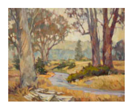
161906 ABBOTT, WHITNEY BROOKS. Road to the Canyon, 16 x 20 inches | Oil on canvas Signed lower left