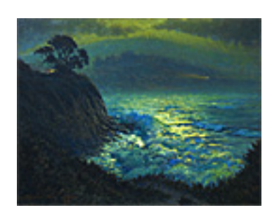
160152 VAN STEIN, THOMAS. Moonlit Surf, Carpinteria, 22 x 20 inches | Oil on panel Signed