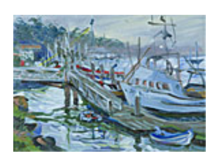
160136 FOSTER, KAREN. Morro Bay Morning, 9 x 12 inches | Oil on canvas Signed