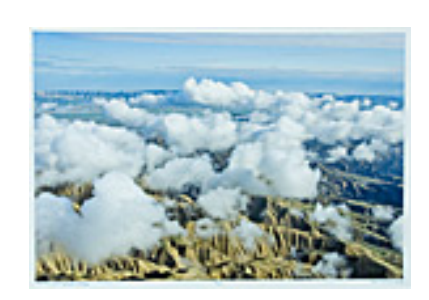
160131 DEWEY, BILL. Clouds over Caliente Ridges, 11 x 16.625 inches | Photograph Signed