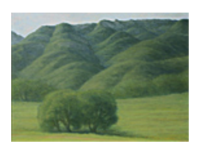
160155 VEDDER, SARAH. Folded Hills, 18 x 24 inches | Oil on panel Signed