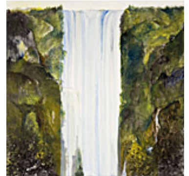
161716 GOLDYNE, JOSEPH. Small Fall I, 2005 12 x 12 inches | Mixed media on Signed