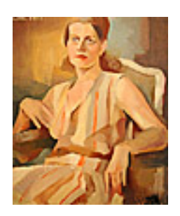
153308 LANE, BETTY. Woman in Chair, 1929 22 x 18 inches | Oil on canvas Signed upper left