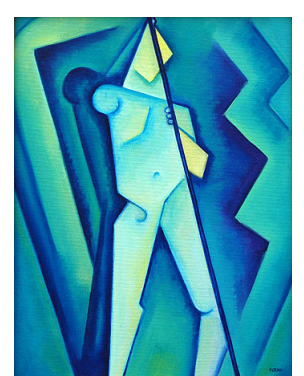
152794 PERKO, ANGELA. Charon - Male Nude, 2008. 16 x 12 inches | Oil on canvas Signed on back