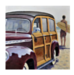
160637 FRANCIS, JON. Here We Go, 2017 12 x 12 inches | Oil on panel Signed