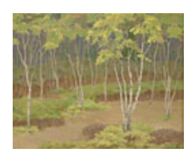
158093 DABO, THEODORE. Paper Birch Trees Along Creek, c. 1905 10 x 12 inches | Oil on panel Signed lower right