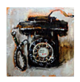
162233 SALAMON, BRADFORD. Black Manhattan, 2019 16 x 16 inches | Oil on canvas Signed