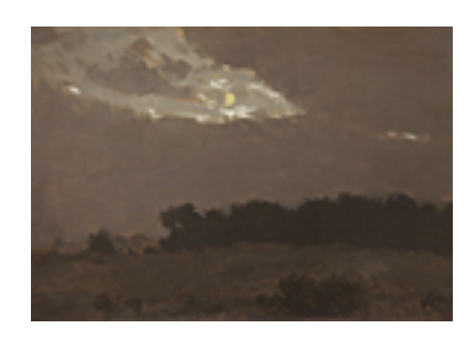
153486 DE FOREST, LOCKWOOD. Moonlight in Clouds Over Treeline, ND 9.75 x 14 inches | Oil on artist's card Unsigned.