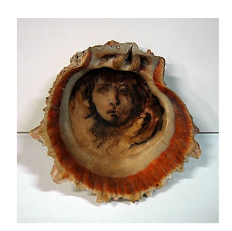
152749 BERMAN, EUGENE. Mother of Pearl, c. 1930s 4 x 4 inches | Other Unsigned