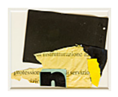
160850 KIRK, FRANK. Untitled Collage, 2017 7.5 x 9.5 inches | Collage Signed