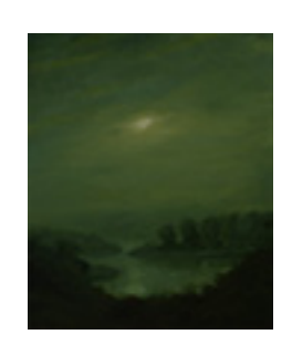
161560 PETERS, CHRIS. Blakelock Lake, 2018 24 x 20 inches | Oil on linen over