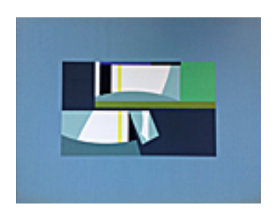
156517 GORDIN, SIDNEY. Paper Construction 2, c. 1970s 19 x 24 inches | Collage Signed lower right