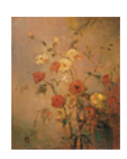
156176 DABO, LEON. Garden Flowers in Still Life, c. 1918 30 x 24 inches | Oil on masonite Signed lower left