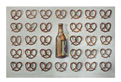
158530 SWIGGETT, JEAN DONALD. 32 Pretzels / One Bottle of Beer, 1974 20 x 30 inches | Prismacolor on Signed lower right