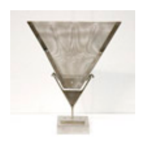
162225 BORTOLAZZO, KEN. Torch, 2003. 10 x 8.5 x 3 inches | Stainless steel. Signed