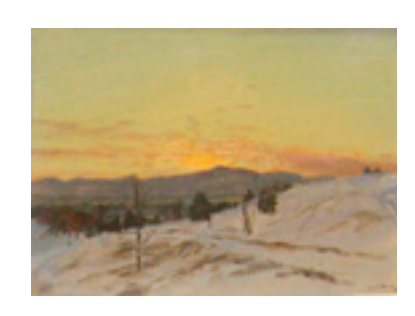
154756 DE FOREST, LOCKWOOD. View From Olana II, February 13, 1875 7 x 9.5 inches | Oil on artist's card Signed lower right.