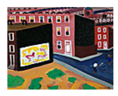
151951 LANE, BETTY. Baltimore, 1950 8 x 10 inches | Watercolor on paper Signed lower right