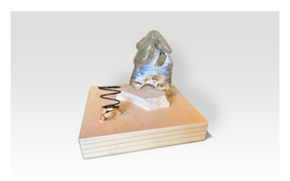
166182UYESAKA, DUG.Roswell, 20246.5 x 8 x 8 inches | Mixed media

166181 TIBBLES, SUSAN. Kitty, 2024 9.5 x 5 inches | Mixed media